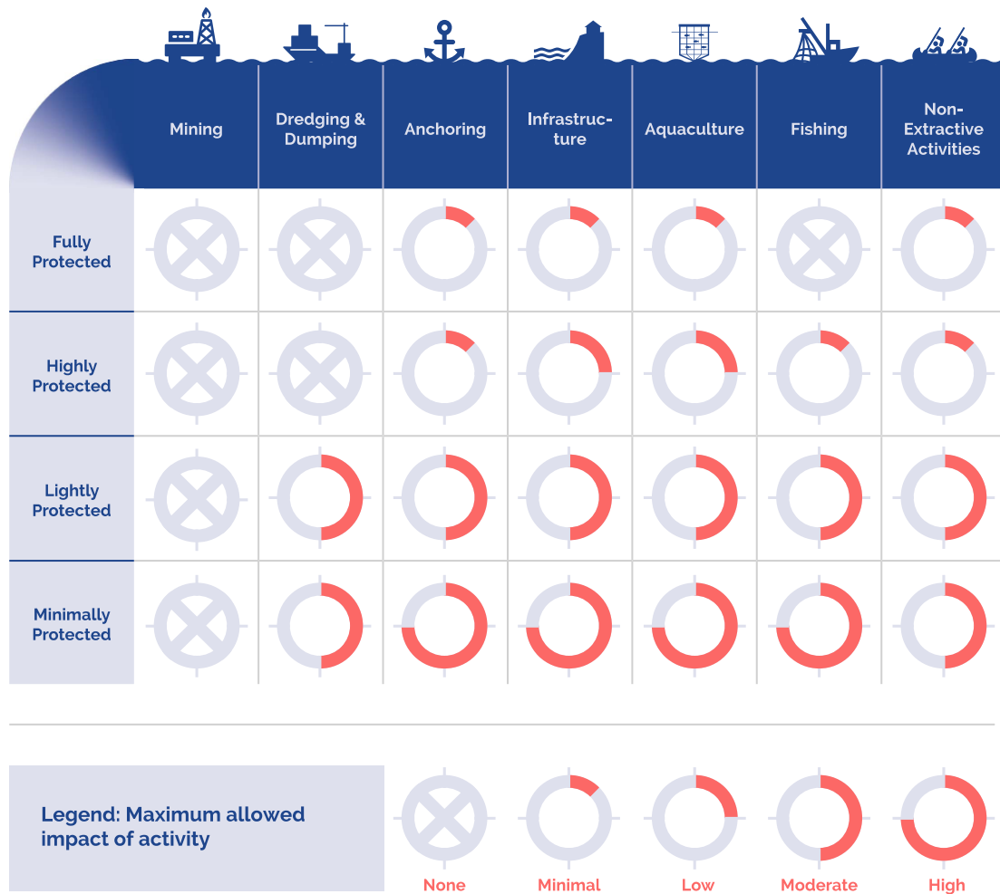
Fig. 1. Level of protection based on maximum allowed impact of seven potential activities in

MPAs. An MPA or MPA zone can be categorized into one of four LEVELS of protection: Fully, Highly, Lightly, or Minimally, based on seven types of activities and their impacts (for a decision tree approach, see Fig. S2). Dials indicate the scale of impact that may be occurring at a given protection level: none, minimal, low, moderate, or high/large. If impacts are high/large, the site must still provide some conservation benefit in order to meet the definition of an MPA. If the impact of any of these activities is greater than “high”, the MPA is incompatible with the