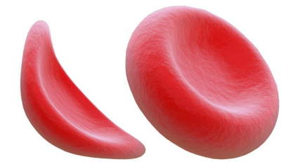
Fig 1. Red blood cell sickling in SCT due to the presence of both normal (HbA) and abnormal (HbS) hemoglobin.

Sickle cell trait (SCT) is an inherited red blood cell condition without medical consequence in most cases. However, it is strongly associated with increased risk of exercise-induced sudden death, in particular in warm environment.