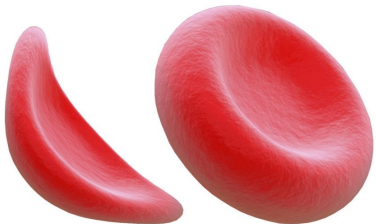
Fig 1. Red blood cell sickling in SCT due to the presence of both normal (HbA) and abnormal (HbS) hemoglobin.

Sickle cell trait (SCT) is an inherited red blood cell condition without medical consequence in most cases. However, it is strongly associated with increased risk of exercise-induced sudden death, in particular in warm environment.