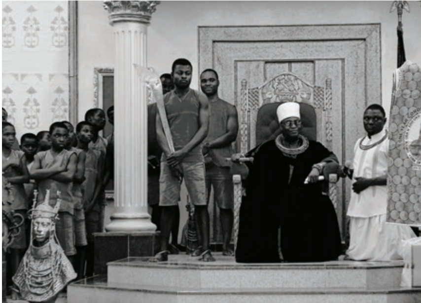
Ewuaro II, Oba of Benin – Nigeria – September 2018

While it is clear, as we have seen, that the Oba is a sacred individual, it seems more uncertain to say whether "priests" should be considered sacred figures or as mere agents responsible for performing the rituals.