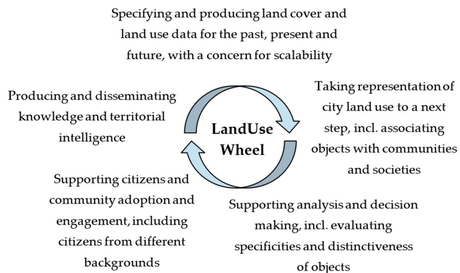
Figure 2. Our proposed LandUseWheel symbolizes the life cycle of information, data and knowledge related to land use. This circle only portrays the high-level functionalities that are detailed in Table 1.