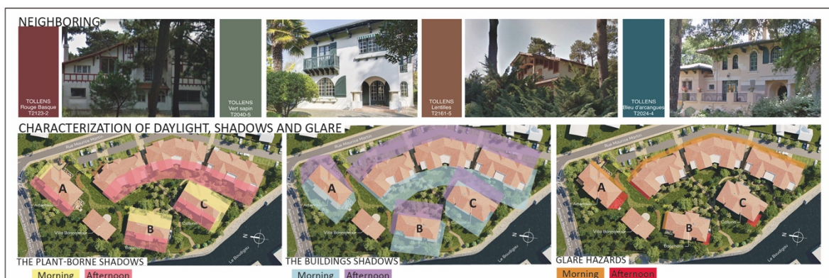
Figure 1 : Environment Study

The first phase consisted of a study of the existing light, environment, chromatic and architectural identity of the site (see Figure 1).