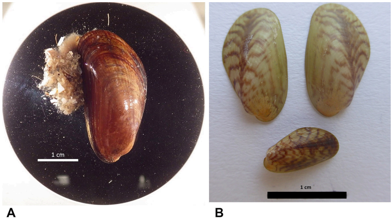
Figure 1. Arcuatula senhousia specimens (A) from Dunkirk, and (B) from Port Atlantique La Rochelle.