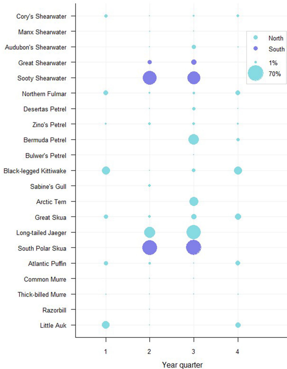
FIGURE 2 Percentage of biogeographic population of each species estimated to be using the hotspot for each year quarter. Colors indicate if the species breeds in the northern or southern hemisphere

estimated 5 million adults. At-sea surveys previously indicated that relative abundance peaked in this area, but this is the first time that a seabird aggregation of this absolute abundance has been robustly quantified anywhere in the high seas. The hotspot qualifies as an IBA and can be considered the most important oceanic foraging grounds for the community of seabirds in the OSPAR maritime high seas area and one of the most important concentrations of migratory seabirds in the Atlantic. Seabirds using this hotspot originated from a minimum of 56 colonies in 16 different countries. Many of these species traveled great distances to use the area, with some using it year-round, suggesting that food availability in the area is consistently