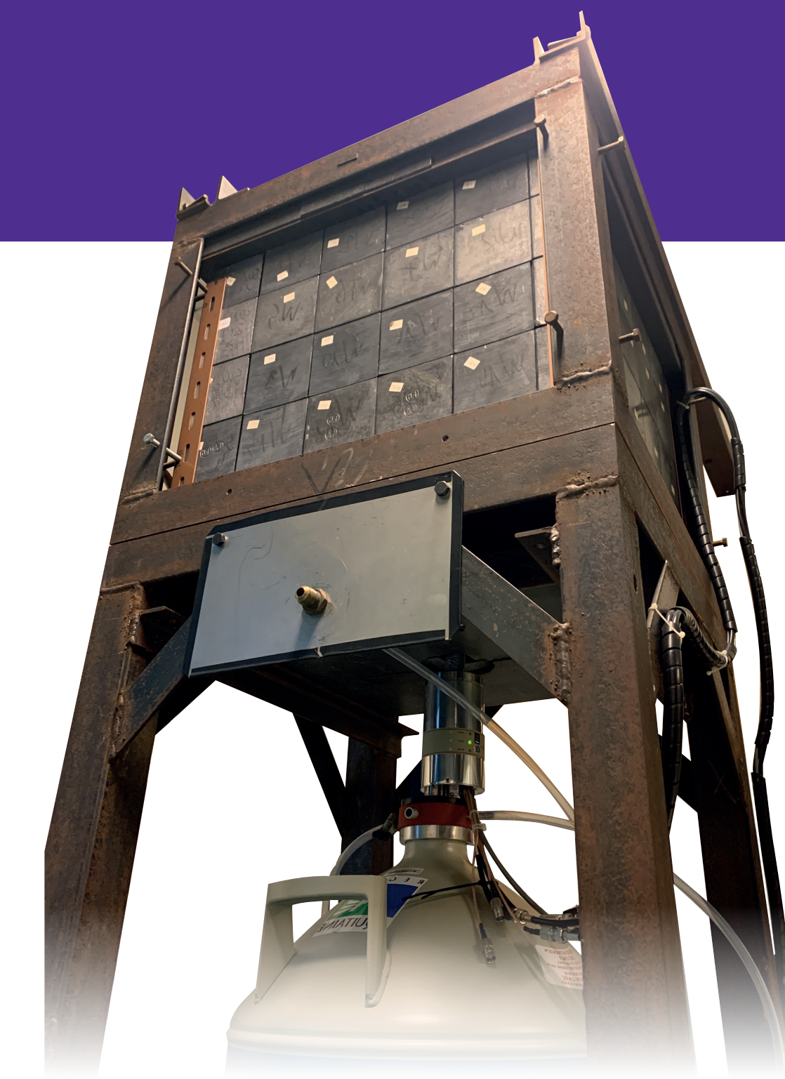
Gamma spectrometer in use at IRAMAT-CRP2A; right : broad energy and low background Germanium; left : Canberra InSpector1000.

Lack of transparency: details of the spectrum processing are not presented in publications and in-house solutions are not made available to the community. This severely limits the reproducibility and reliability of the measurements; see [4] for a broader discussion in the field of luminescence dating.