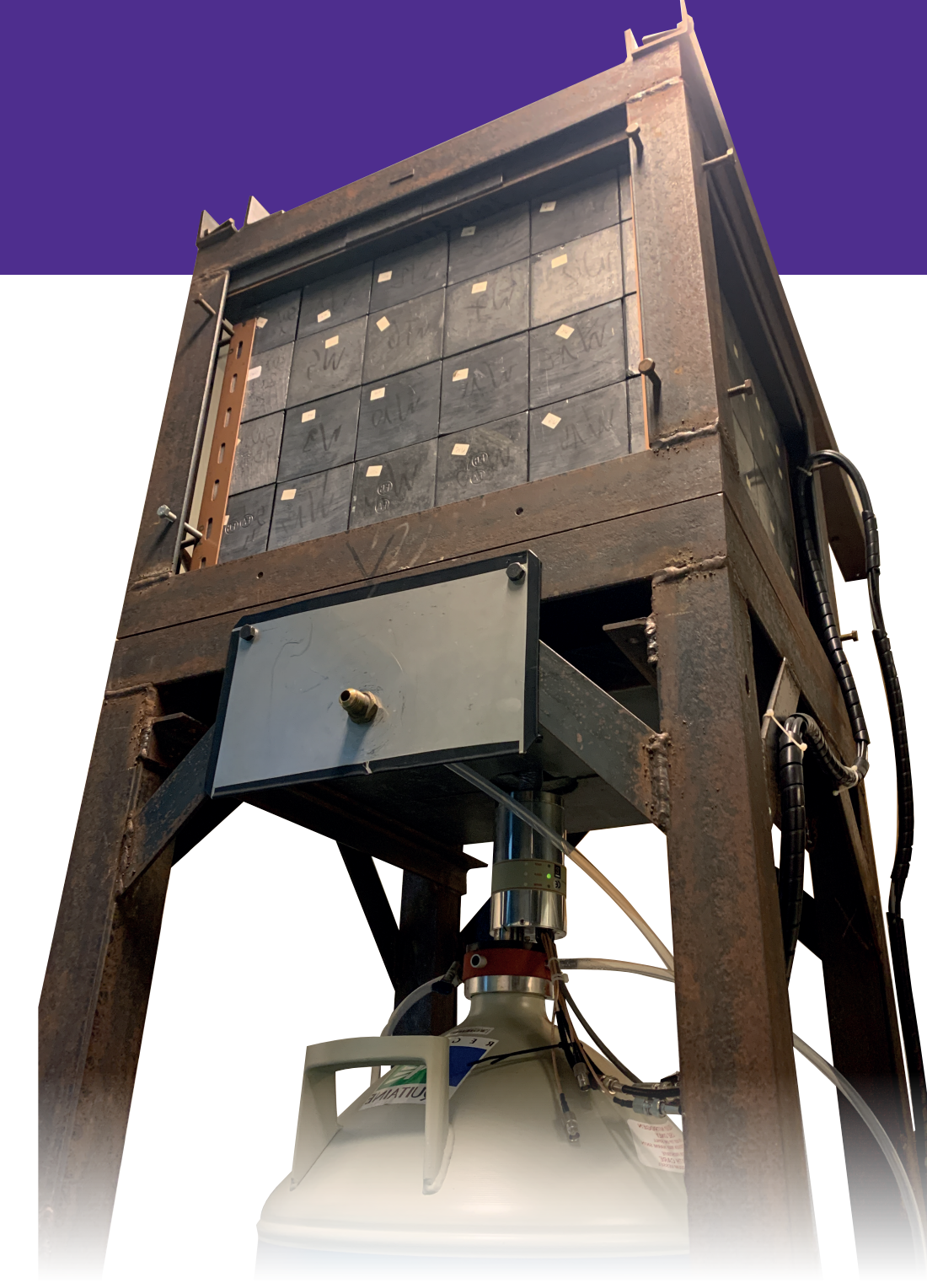
Gamma spectrometer in use at IRAMAT-CRP2A; right : broad energy and low background Germanium; left : Canberra InSpector1000.

Lack of transparency: details of the spectrum processing are not presented in publications and in-house solutions are not made available to the community. This severely limits the reproducibility and reliability of the measurements; see [4] for a broader discussion in the field of luminescence dating.