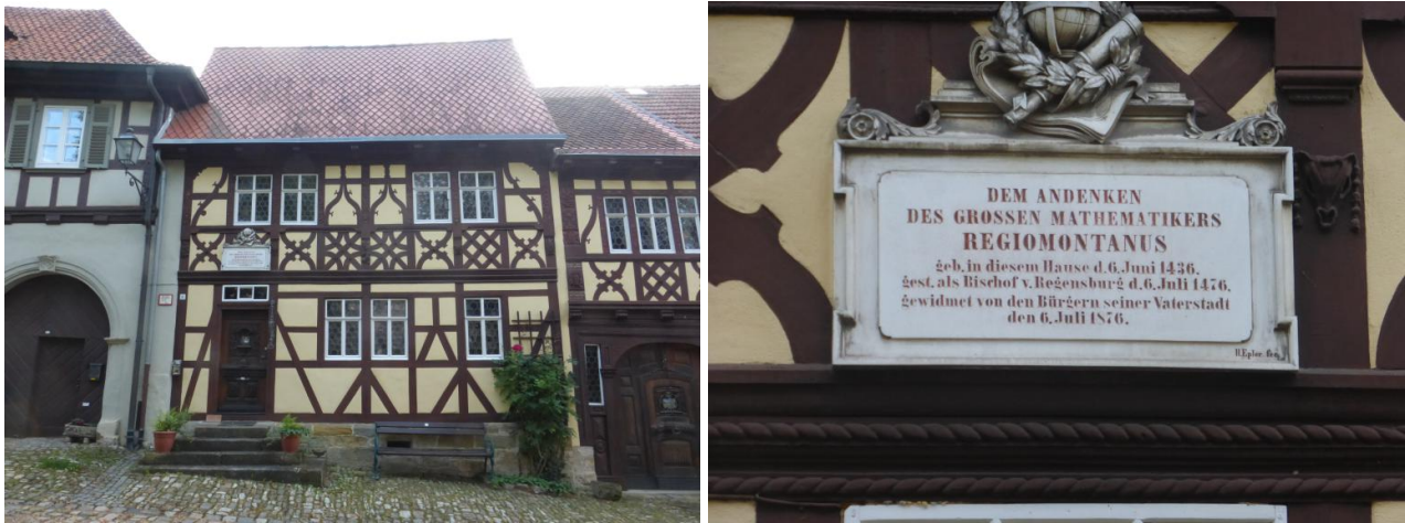
Figure 11: Regiomontanus's probable birthplace in Königsberg, Bavaria.

After having studied in Leipzig, he came to Vienna around 1450 and became a friend and pupil of Georg von Peurbach. In 1457, this is where he took his Master's degree and was appointed to the faculty, hence a colleague of Peurbach. 211