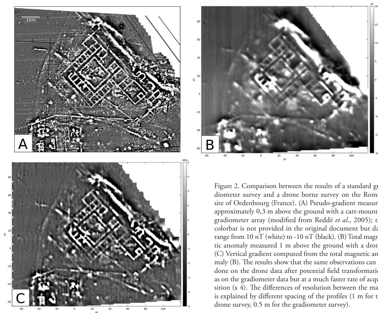
Figure 2. Comparison between the results of a standard gradiometer survey and a drone borne survey on the Roman site of Odenbourg (France). (A) Pseudo-gradient measured approximately 0,3 m above the ground with a cart-mounted gradiometer array (modified from Reddé et al. , 2005); the colorbar is not provided in the original document but data range from 10 nT (white) to -10 nT (black). (B) Total magnetic anomaly measured 1 m above the ground with a drone. (C) Vertical gradient computed from the total magnetic anomaly (B). The results show that the same observations can be done on the drone data after potential field transformation as on the gradiometer data but at a much faster rate of acquisition (x 4). The differences of resolution between the maps is explained by different spacing of the profiles (1 m for the drone survey, 0.5 m for the gradiometer survey).

2007 for the detection of unexploded ordnance with a precision of two nT (Munsch et al. , 2007). Mono- and multi-magnetometer systems have been developed for ground, drone and aircraft surveys (Gavazzi et al. , 2016). Such devices have been used in ground surveys for archaeological prospection with increased resolution (0.3 nT), in large scale surveys over dozens of hectares (e.g. Gavazzi et al. , 2017) to high-resolution surveys of subtle structures like post holes (e.g. Wassong & Gavazzi, 2020). Overall, the use of this kind of equipment with potential field interpretative tools showed a high versatility for archaeological, environmental and geological applications at different scales, with surveys conducted with profile spacing and height-to-ground ranging from 0.1 to 120 m and acquisition frequency ranging between 25 and 500 Hz (Gavazzi et al. , 2019).