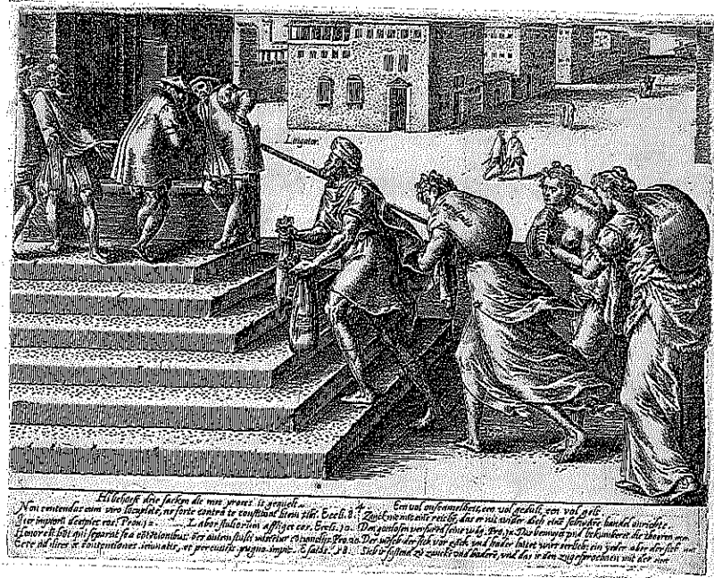
Fig. 10.2 Hendrick Goltzius, Litis abusus (Plate 4), 1597, Rijksmuseum Amsterdam, inv. RP-P-1886-A-10438, http://hdl.handle.net/10934/RM0001.COLLECT.381066