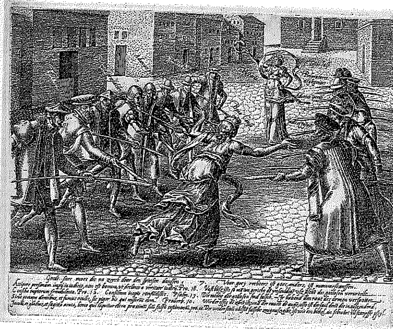
Fig. 10.4 Hendrick Goltzius, Litis abusus (Plate 7), 1597, Rijksmuseum Amsterdam, inv. RP-P-1886-A-10441, http://hdl.handle.net/10934/RM0001.COLLECT.381068