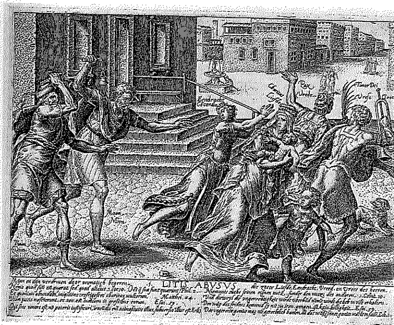
Fig. 10.1 Hendrick Goltzius, Litis abusus (Plate 1), 1597, Rijksmuseum Amsterdam, inv. RP-P-1886-A-10435, http://hdl.handle.net/10934/RM0001.COLLECT.381062