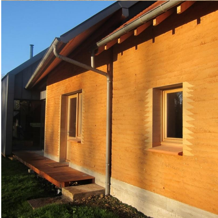
Figure 1: the “Orangerie” rammed earth building during its construction in the centre of Lyon (top, © Fabrice Fouillet). The arches are load-bearing structure holding the timber floor and the flat roof. The timber floors are ensuring safety against earthquakes by tying the facades together and connecting them to the vertical timber structure around the lift (in the middle, of the photo). The partial on-site automation of the construction enabled to deliver the project with reasonable cost and time. Down left: A single-family house in rammed earth, Burgundy, France (© Nicolas Meunier).

The strength of the cohesion is driven by the clay types, the clay content, the microstructure and the hydration state (water content). Clay minerals exhibit a large diversity. For example, their specific surface ranges from 20 \text{ m}^2 \cdot \text{g}^{-1} for a kaolinite to 850 \text{ m}^2 \cdot \text{g}^{-1} for a montmorillonite (Meunier 2005). For the same clay content, two different earths can have very different behaviours. Moreover, the microstructure of the earth matrix is driven by the implementation type (Kouakou and Morel 2009). To propose prescriptive suitability thresholds for earthen architecture, it would require thorough, long and expensive tests. Consequently, it is not possible to predict the performance of an earthen wall from its intrinsic composition like it is possible with concrete; their performance should be measured through performance-based tests. Nevertheless, it is possible to propose decision tools for planning authorities and earthwork contractors to assess the potential of excavated soils for