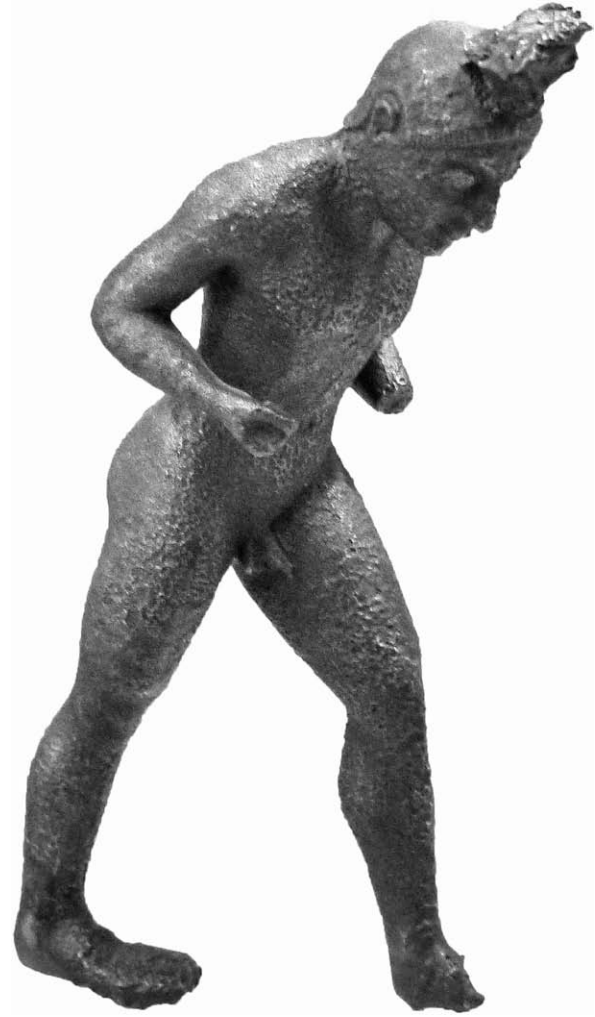
Fig. 9: X13662, National Archaeological Museum, Athens (©Hellenic Ministry of Culture and Sports / Archaeological Receipts Fund – photograph author). Found on the Acropolis of Sparta. 535–525 BC.