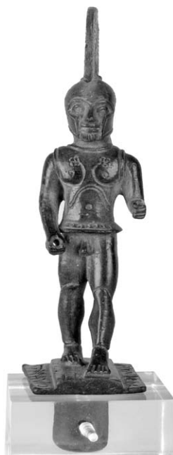
Fig. 6: X7598, National Archaeological Museum, Athens. Found at the sanctuary of Apollo Maleatas. 555–545 BC (stylistic datation) / 530–520 BC (epigraphic datation).