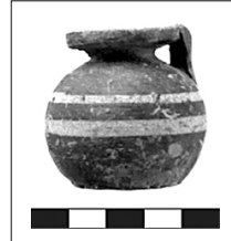
Fig. 3: Miniature aryballos from the Amyklaion. Sixth century BC (©Amykles Research Project – photograph author).