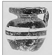
Fig. 4: Miniature aryballos from Aigies. Sixth century BC (Bonias 1998, No. 102).