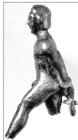
Fig. 8: 3242, Archaeological Museum, Sparta (Ephorate of Antiquities of Laconia – Regional Office ©Hellenic Ministry of Culture and Sports / Archaeological Receipts Fund). Found on the Acropolis of Sparta. 530–520 BC.