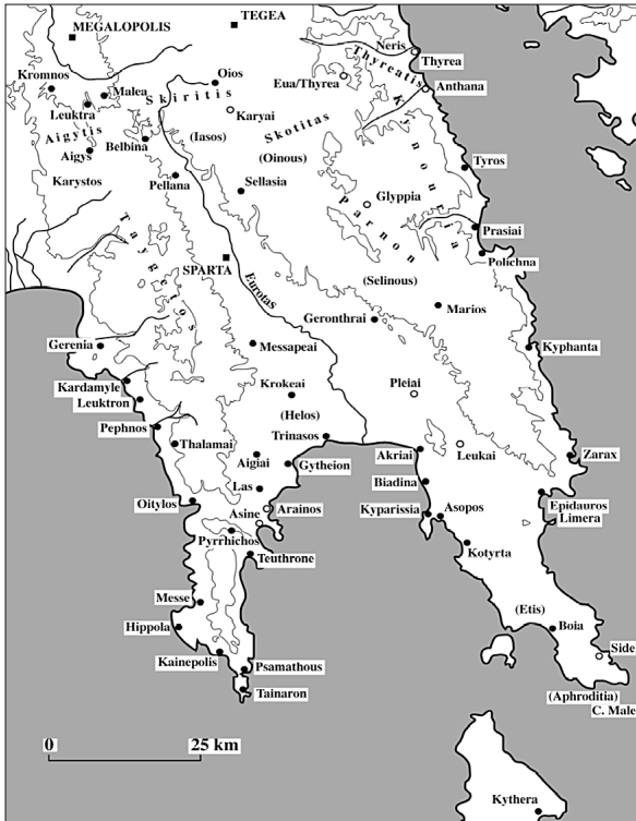
Fig. 1: Map of Laconia and its perioikic communities (G. Shipley 2006, Fig. 1)