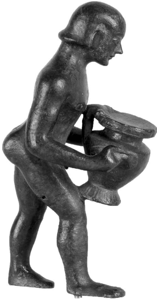
Fig. 7: X7614, National Archaeological Museum, Athens. Found at the sanctuary of Apollo Hyperteleatas. 540–530 BC.