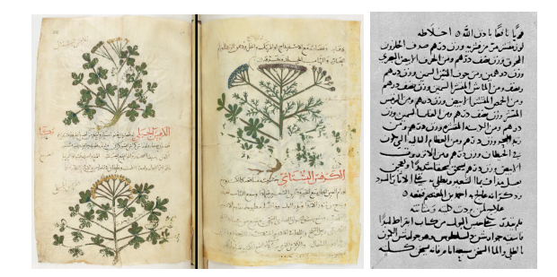
Fig. 2. Example of pages of manuscripts - Left: Dioscorides Pedanius of Anazarbos, Kitab Disqūrīdis (Dioscorides's book), circa 1100–1200, National Library of France. Right: Al-Kindī Folio 98r

ISA), and a shorter one [4] for pharmacists outside of the hospital who were considered less skillful (designated by ISP);