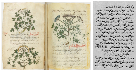
Fig. 2. Example of pages of manuscripts - Left: Dioscorides Pedanius of Anazarbos, Kitab Disqūrīdis (Dioscorides’s book), circa 1100–1200, National Library of France. Right: Al-Kindī Folio 98r

ISA), and a shorter one [4] for pharmacists outside of the hospital who were considered less skillful (designated by ISP);