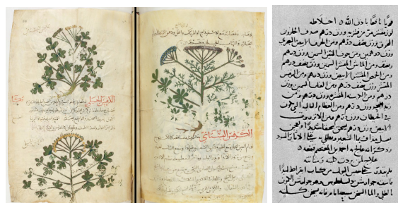
Fig. 2. Example of pages of manuscripts - Left: Dioscorides Pedanius of Anazarbos, Kitab Disqūrīdis (Dioscorides’s book), circa 1100–1200, National Library of France. Right: Al-Kindī Folio 98r

ISA), and a shorter one [4] for pharmacists outside of the hospital who were considered less skillful (designated by ISP);