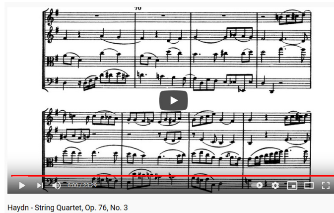
FIGURE 3. Slow movement from Haydn's Emperor quartet Opus 76, N3.