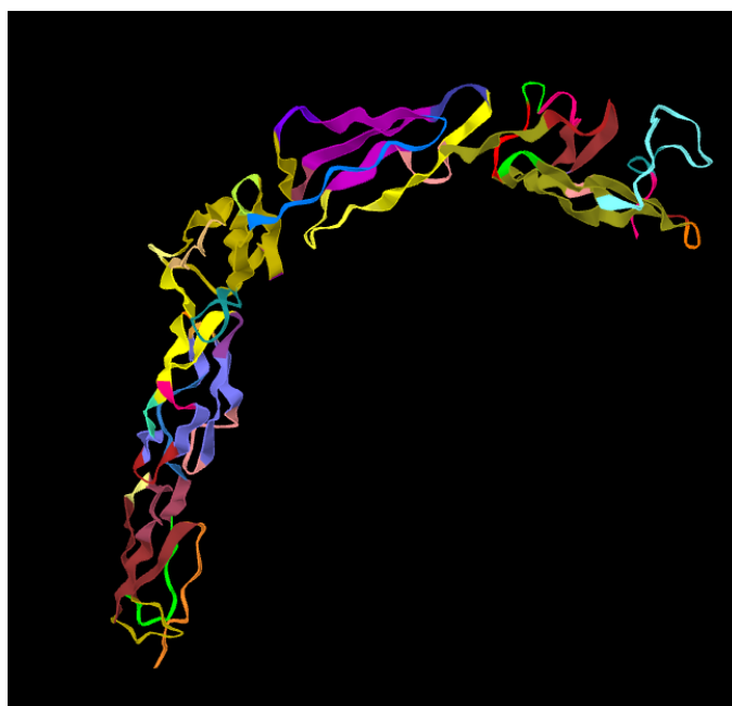
FIGURE 2. A picture of the secondary structure of the apolipoprotein-H obtained with the software [11].

six digits fit those of F_2 and higher order digits could not be reached. The reader may refer to our paper [1] where such a good fit could be obtained for the sequences in the arms of the protein complex Hfq (with 74 aa). This complex with 6-fold symmetry is known to play a role in DNA replication.