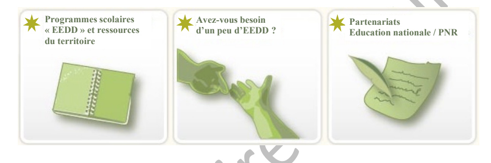
Figure 11.4 Excerpt from the "Teacher's Guide" page of the MA portal, in French

The first objective is to indicate that the enunciative instance is at its service. For example, it proposes a "teacher's guide" [MA 3] where clicking on an outstretched hand provides an answer on education for sustainable development to a question formulated in the second person (Figure 11.4). The teacher is in fact the beneficiary to whom "tools" are systematically offered, most often in the form of an inventory: a title, a short description and one or more hyperlinks giving access to brochures or annual catalogues of the paid offer [ML 3; CHA 3], more rarely to free resources [MB 3].