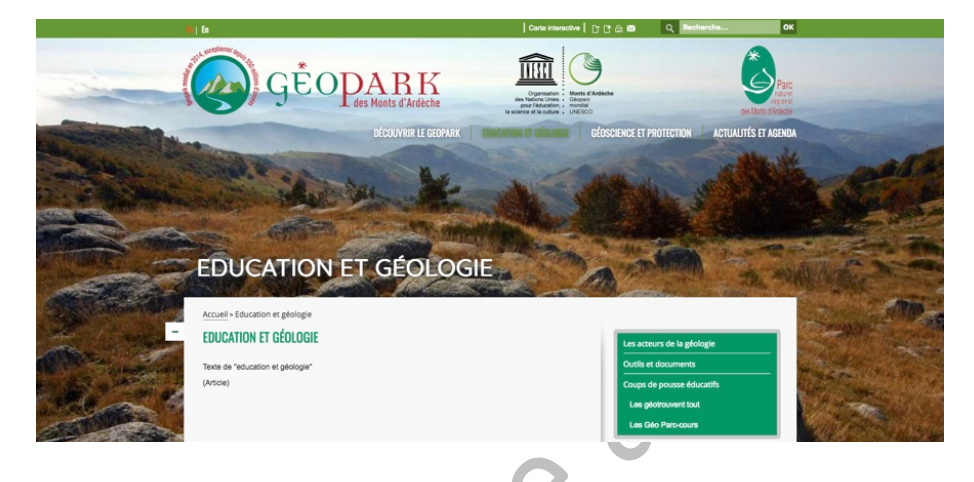
Figure 11.2 Extract from the site of the Ardèche Mountains Geopark [ARD 1]. The "-" sign allows the entire central frame to be retracted

green for hyperlinks [MB 1]. With the exception of the UNESCO logo, green thus seems to refer to the regional natural park as an embodiment of biotic nature, while red, a color also favored on the Chablais site in the subtitles and the side menu, seems to symbolize the telluric forces of abiotic nature (Figure 11.3).