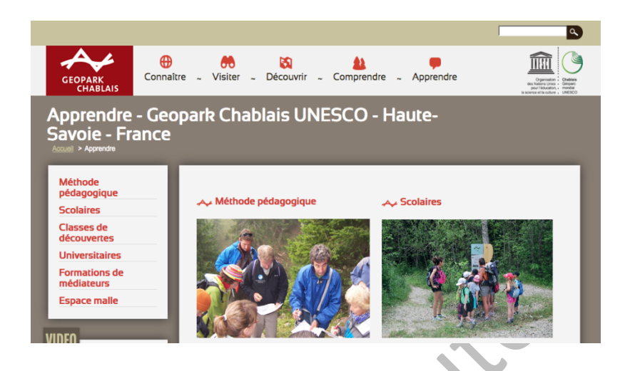
Figure 11.3 Extract from the home page on education in the Chablais geopark, in French

From the education home page, traffic is possible through side menus and the banner, but also, within the page, by an alignment of titled photographic thumbnails [CHA 1; ML 1; MB; MB 1] and/or by lists of hyperlinks [MA 1; MB 1] directing to documents internal to the site or to the partners' sites. These arrangements give a visual impression of the multiplicity of places, actors and situations: the educational offer in the labelled territory seems excessive and varied. To reflect the diversity of educational interventions, the Chablais site presents a map with location icons showing all activities [CHA 2]. By placing them in a topography of labelled places and landscapes, the Chablais thus insists on their idiographical dimension, as a promise of pedagogical added value.