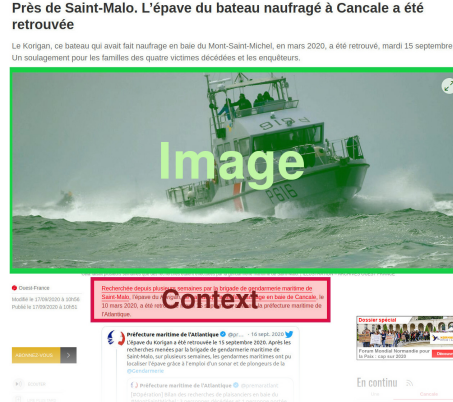
Fig. 1. An example of the WICE setting: an image, and its textual description ( context ) in the webpage.

extraction from a webpage is not tractable. We investigate how the HTML data structure may help in extracting images’ contexts.