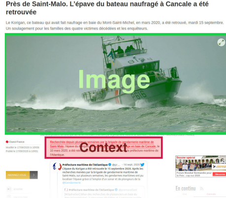
Fig. 1. An example of the WICE setting: an image, and its textual description ( context ) in the webpage.

extraction from a webpage is not tractable. We investigate how the HTML data structure may help in extracting images’ contexts.