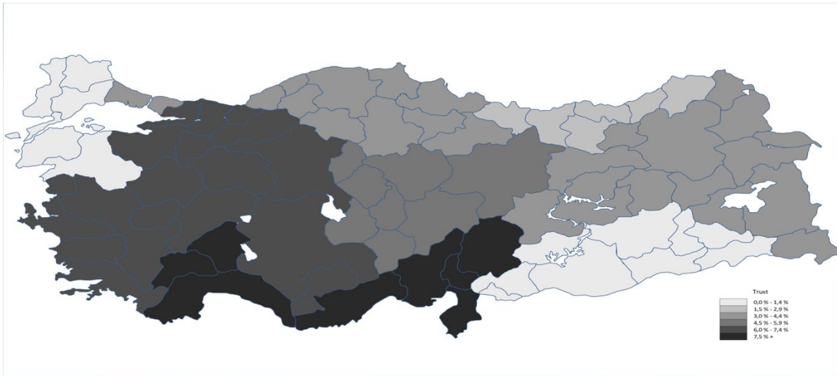
Figure 1a. Generalized trust across regions in Turkey, 2007.

Note: The darker the shade is, the stronger generalized trust is. Source of data: World Values Survey