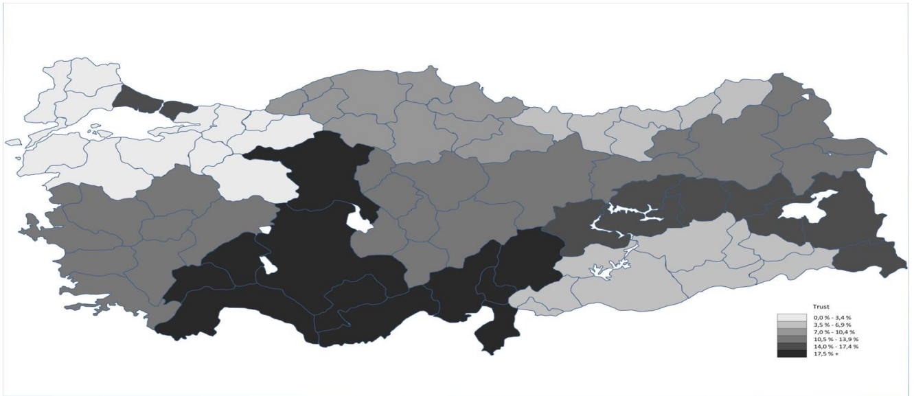
Figure 2a. Generalized trust between regions in Turkey, 2012.

Note: The darker the shade is, the stronger generalized trust is. Source of data: World Values Survey