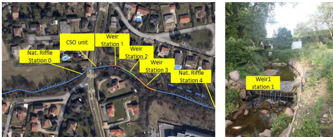
Fig.1: (left) Location of sampling points in the Chaudanne River; (right) a picture of weir number 1.

The reference station (0) is located upstream of the combined sewer overflow unit. It is a natural riffle, followed just downstream the CSO unit, by three artificial small weirs (stations 1, 2, 3) made of wooden trunks intertwined (Fig.1). That type of construction allows the water to seep through although it is not build for this purpose. The weirs were built in 2010 to stop the river bottom incision and the collapsing of river-banks resulting from the CSOs. The pools created upstream of these weirs have been rapidly filled by the sand carried during high flow events. The sand layer is lying on the granite bed-rock. Its depth is of 1m at stations 1 and 3 and of 0.2m at station 2. The last station (4) is a natural riffle like for the reference station 0. Riffles are known to be active metabolic points into rivers because they induce the water percolation (Namour et al., 2015).