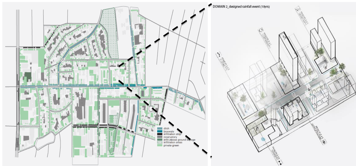
Figure 2 application of the multi-dimensional and multi-layered approach to BGI and Nature as Infrastructure (adapted from Bacchin, 2016).

2013); Flood & drought resilience (Rijke et al, 2014); Multiple functionality of infrastructure systems; Multiple use of land in urban areas; Sustainability and liveability; A clear business case (e.g. Nylen & Kiparsky, 2015); adaptive management (e.g. Brisley et al, 2015) and Nature as performative infrastructure (Bacchin, 2016). Sustainability is the over-arching vision (e.g. Raskin et al, 2010) and water sensitivity, the vehicle by which the various threads listed can be delivered; but the impermanence of first-decisions is also recognised in the need to use for example, decision trees to plan for adaptation. In committing to this vision, stakeholders now require a clear and defensible business case (e.g. Berkley Law, 2015), although many are not yet clear how to handle the many uncertainties in the process. The framework links a number of principles to expected outcomes (i.e. what society and people value such as a good quality of life, rather than specific 'things' that are delivered by services). Taking advantage of 'performative nature' for urban infrastructure has been shown to be effective in planning how to deal with e.g. flooding in urban areas (Bacchin, 2016) but requires a multi-layered approach from pan-city through catchment to local scales (Figure 2).