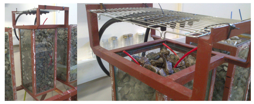
Figure 1. Scheme of the laboratory experiment and the rainfall simulation device.

A standard HFD design composed of Type B aggregate ( BSI , 2006) was simulated in the laboratory. Four replicates of this design were used for statistical replication, helping in the comparison with the design tools. The rigs used in this experiment were composed of plate-glass and their dimensions were 21.5 cm x 21.5 cm x 65.0 cm for a total volume of material of 0.030 m<sup>3</sup>. No bottom pipe was used in these models in order to get the infiltration rates of the Type B material and avoid the limitations given by the pipe, allowing a more accurate comparison with the outputs obtained by using the software from design tools.