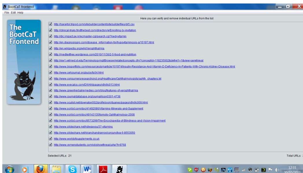
Figure 1 - URL list generated on the basis of the CATALOGA list of compound words

The list of web sites contains relevant information sources such as medical texts, glossaries, thesauri and text corpora related to the subject matter of the analysed text.