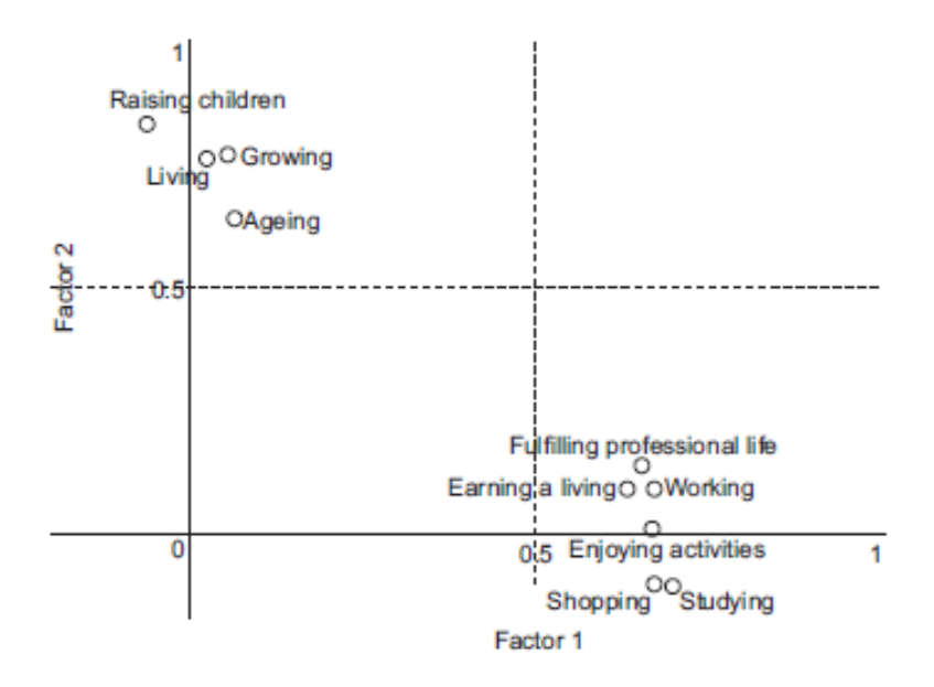
Fig. 4. Factor loadings for the city as a good place to [...]

Living in the city then corresponds to two perspectives. The first focuses on the use of the city by individuals, who perceive that they can successfully carry out their daily activities there, and the existing literature has shown that this perception of control directly affects behavioral intention and behavior (Fishbein and Ajzen 2010). The second view is that city living matches the individual's major universal values (Schwartz and Bilsky 1990; Schwartz 1996; Schwarz 2011). Attitudes towards the use of the object prevail in the first case, whereas the direct attitudes towards the object (the city) prevail in the second one. We can then consider the first factor as an instrumental representation of the city and the second as the city as a way of life.