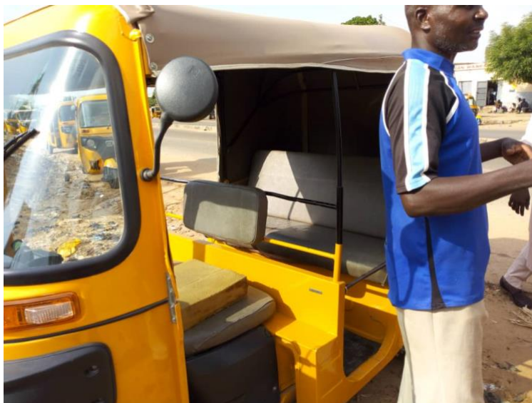
3: Typical interior of a young rider's adaidaita-sahu