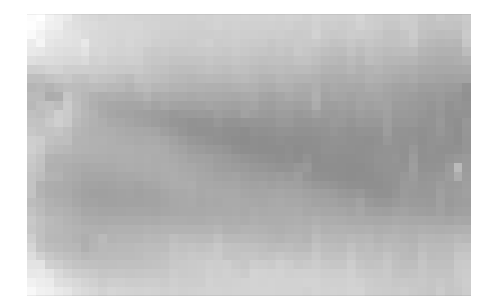
Figure 3. The pixel matrix of the 2D projection of a log.

We chose the B-spline since it is appropriate for surface fitting [16]. Once the number of points per slice is normalized, the algorithm proceeds with the construction of the normalized scan by creating new slices and aligned points . For that purpose, it computes W new slices containing H points each. In our experiments, H = 128 points per slice worked well. Furthermore, we determined that the maximum length of a log is under 560 centimeters and chose W = 128 slices. Therefore, we fixed the step between each slice to 4.73 cm. To position the new points for the desired slice we create a B-Spline from all points at index W_i . Since we want a constant number of points per log, dummy slices are added to lengthen shorter logs, i.e., logs with fewer than W slices are padded with slices containing H zero-valued points.