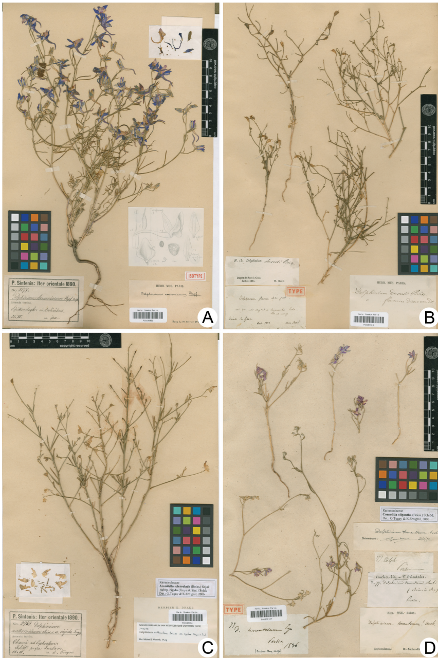
Figure 2. Three lectotypes (and one isolectotype) selected among the 21 lectotypes designated in this article A isolectotype of Delphinium armeniacum Huth (P00195865; http://coldb.mnhn.fr/catalognumber/mnhn/p/p00195865 ) B lectotype of D. deserti Boiss. (P00197319; http://coldb.mnhn.fr/catalognumber/mnhn/p/p00197319 ) C lectotype of Delphinium sclerocladum Boiss. var. rigidum (Frey & Sint.) Hossain & P.H.Davis (P00195794; http://coldb.mnhn.fr/catalognumber/mnhn/p/p00195794 ) D lectotype of D. tomentosum Boiss. (P00201127; http://coldb.mnhn.fr/catalognumber/mnhn/p/p00201127 ). All four specimens are kept at P Herbarium.