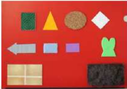
Figure 4: Map of the tactile sheet

The Reader Rabbit game is an adaptation of a french multimedia game (“Lapin Malin” 2 ) for children from 2 to 4 years old. The child discovers four educational games helped by animals and by music. This game is designed for using another specific and common peripheral: the tactile board (figure 4).