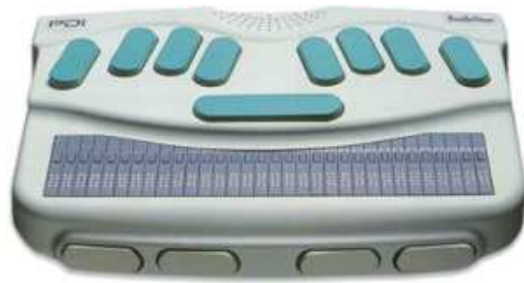
Figure 3: Map of a braille terminal

A menu contains many items with text. The blind children can use a braille terminal 1 (figure 3) in order to know what is written on the menu items. The words are displayed on the braille keys.