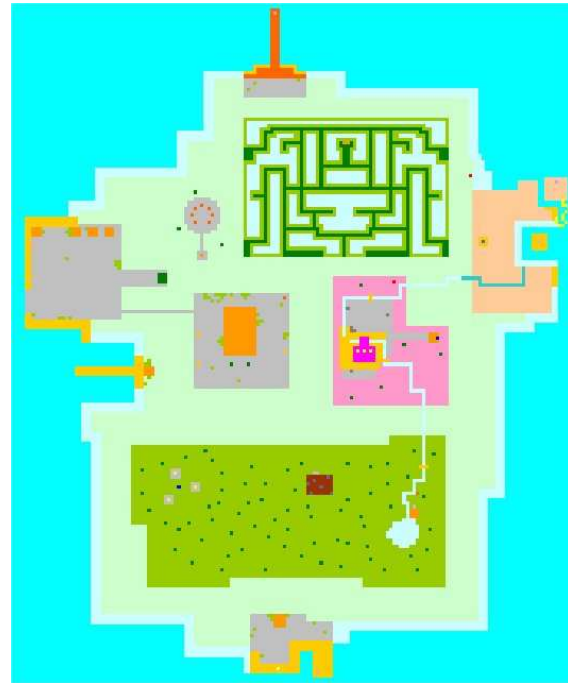
Figure 2: Map of the Tim Journey island

As an additional help, the player must find a sonar that will allow him to highlight the very important sounds. An external narrator gives hints to the player when this one doesn't know what to do.