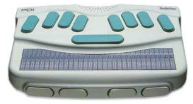
Figure 3: Map of a braille terminal

A menu contains many items with text. The blind children can use a braille terminal <sup>1</sup> (figure 3) in order to know what is written on the menu items. The words are displayed on the braille keys.