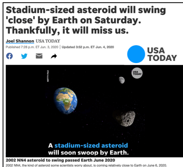
FIGURE 1: June 2020 example of mainstream media carrying “asteroid alert” stories that dull attention from meaningful close approach events. Despite the depiction shown, 2002 NN4 missed the Earth by >13 lunar distances.