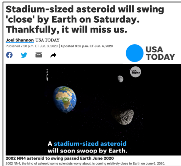
FIGURE 1: June 2020 example of mainstream media carrying “asteroid alert” stories that dull attention from meaningful close approach events. Despite the depiction shown, 2002 NN4 missed the Earth by >13 lunar distances.