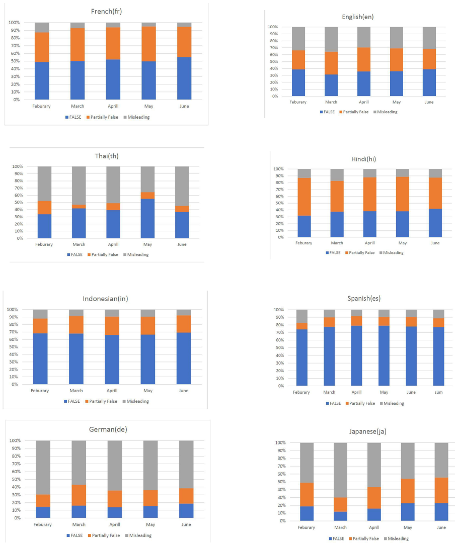
Fig. 2: Month-wise Disinformation Distribution in Languages.