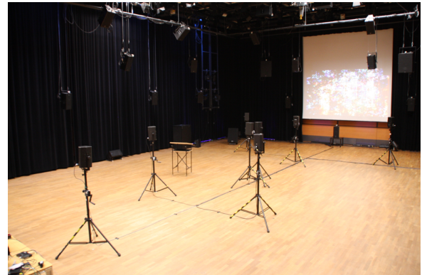
Figure 1. Physical installation setup at ZKM, Karlsruhe.