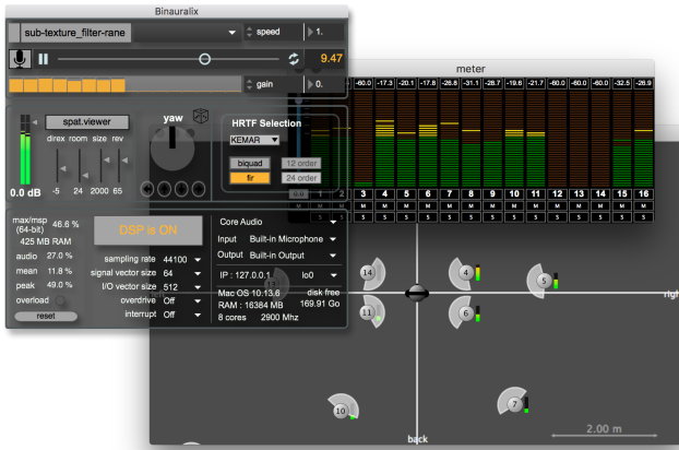
Figure 2. Binauralix GUI showing meterbridge and spat.viewer windows.