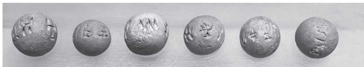
Fig. 1. Cypro-Minoan clay balls, 13 th -11 th centuries BC, Late Bronze, LC IIC-LC IIIB (Nicosia, Cyprus Museum)

Three different CM signaries have been identified, with a single document, the most ancient, representing a very early phase of the script invention outside the main tripartite classification. The Cypro-Minoan 2 (CM2) syllabary is documented only by a handful of clay tablets from Enkomi, dating from the 13 th -12 th century BC and bearing long and carefully incised texts. A second signary (CM3) developed outside Cyprus, more precisely in Ugarit, and is also documented by a little number of inscriptions (less than ten). The Cypro-Minoan 1 (CM1) syllabary represents the most widespread variety, attested all along the LB and the Early Iron Age (EIA) by more than two hundred documents. 3 There is no common agreement about the relevance of this tripartite subdivision of the CM corpus. Each one of the CM scripts shares only a limited part of its signary with the other groups, thus suggesting parallel, independent developments; however, this particularity can find geographical and/or chronological explanations, and it can be also be due to the different content or