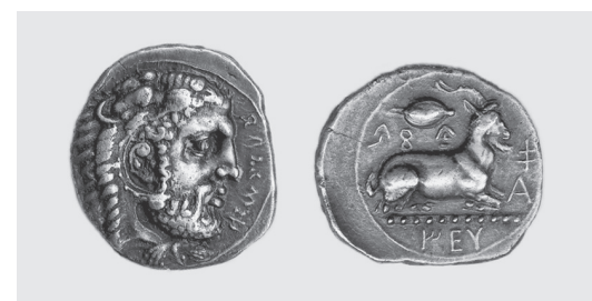
Fig. 5. Silver coin (stater) of Evagoras I of Salamis with digraph legend (London, British Museum, inv. 1888,1103.5)