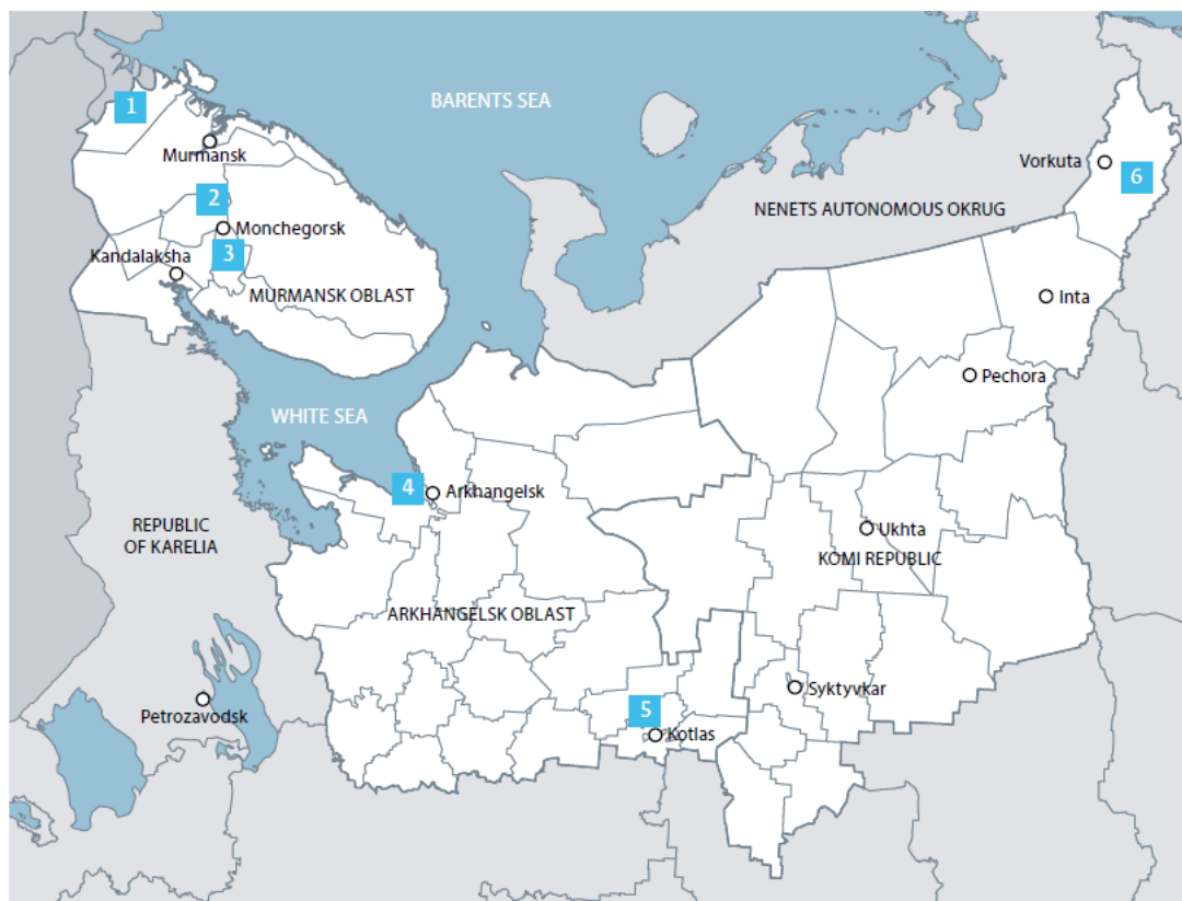
1. Western Kola 3. Khibinsky 5. Kotlassky 2. Central Kola 4. Arkhangelsky 6. Vorkutinsky

It should be noted that the Russian northern municipalities pay a rather little attention to the human dimension of their CCA/SD strategies identifying mainly the ecological and economic challenges and risks. The societal/human security problematique is rarely reflected in the municipal strategic documents and often limited to civil defense programs which are mainly about protection of city residents from natural disasters and technogenic catastrophes (Severodvinsk City Government, 2010; Vorkuta City Government, 2014; Murmansk City Government, 2013). Quite rarely, some city strategic documents mention the need to take care of citizens' personal security by adopting measures to curb street violence and other criminal activities (Severodvinsk City Government, 2010; Murmansk City Government, 2013).