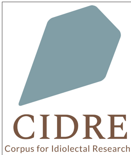
Figure 1 The logo of CIDRE.