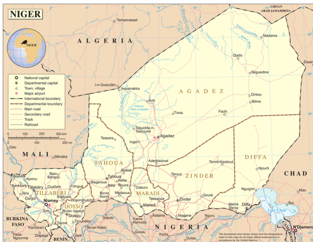
Map of Niger. Niger's population of 23.3 million is concentrated in the semi-arable southern regions as sedentary agriculturalists. Over 70% belong to either the Hausa or Zarma ethnic groups. The nomadic Tuareg and Fulani traditionally inhabit the drier central and northern regions.

more in-depth discussion of basic context, history and political economy and social groups and organisation. This technical brief was prepared by the Institute of Development Studies to support the embedding of social science and anthropological perspectives in UK AID-supported Tackling Deadly Diseases in Africa (TDDA) programme technical assistance as well as its Early Response Mechanism.