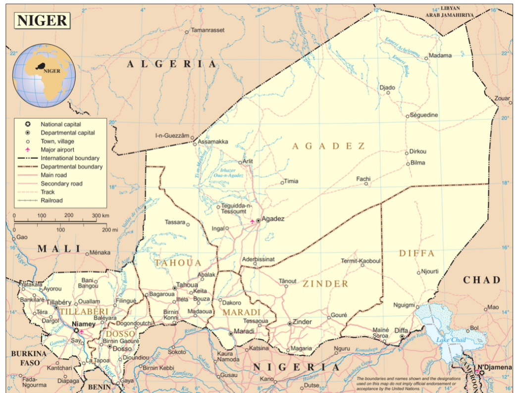
Map of Niger. Niger's population of 23.3 million is concentrated in the semi-arable southern regions as sedentary agriculturalists. Over 70% belong to either the Hausa or Zarma ethnic groups. The nomadic Tuareg and Fulani traditionally inhabit the drier central and northern regions.

more in-depth discussion of basic context, history and political economy and social groups and organisation. This technical brief was prepared by the Institute of Development Studies to support the embedding of social science and anthropological perspectives in UK AID-supported Tackling Deadly Diseases in Africa (TDDA) programme technical assistance as well as its Early Response Mechanism.