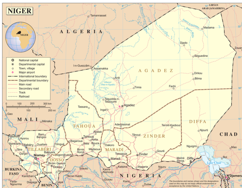
Map of Niger. Niger's population of 23.3 million is concentrated in the semi-arable southern regions as sedentary agriculturalists. Over 70% belong to either the Hausa or Zarma ethnic groups. The nomadic Tuareg and Fulani traditionally inhabit the drier central and northern regions. Source: https://bit.ly/2VwCca3

Niger has recently found itself in the crosshairs of regional conflict and global migration challenges, while it continues to struggle with its own political, social, economic and ecological fragilities. One of the poorest countries in the world, it consistently ranks last or second-to-last in the Human Development Index. 1 This, along with an understaffed, undertrained, and under-equipped health system, means Niger faces immense challenges in relation to infectious disease prevention and control. 2 This brief draws on a review of both academic and grey literature, as well as inputs from social scientists and other experts on Niger. It is structured as follows: 1) an overview of the country's health system, including both the public and private health sectors; and 2) key issues related to infectious disease outbreaks, response, and preparedness and 3) a list of key actors with which early responders may want to engage in response activities. The brief closes with specific implications and recommendations for future epidemic preparedness and response in Niger. Annexes provide more in-depth discussion of basic context, history and political economy and social groups and organisation. This technical brief was prepared by the Institute of Development Studies to support the embedding of social science and anthropological perspectives in UK AID-supported Tackling Deadly Diseases in Africa (TDDA) programme technical assistance as well as its Early Response Mechanism.