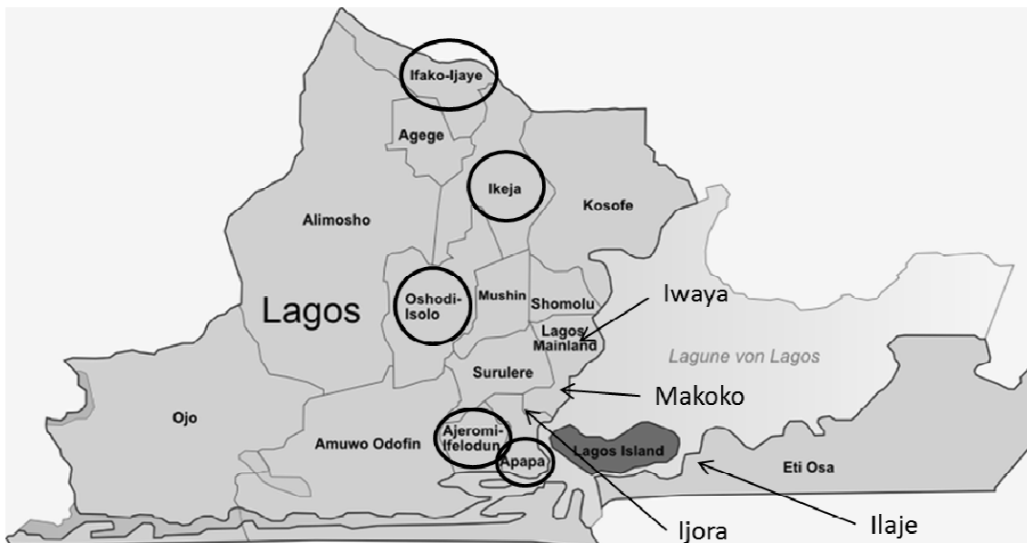
Fig 1 Location of field sites, Lagos, Nigeria (adapted from Wikimedia Commons (Bohr))

Lagos, Nigeria was chosen because approximately two-thirds of the population of Lagos currently live in slums (Agbola and Agunbiade, 2009) and therefore the city has many informal settlements, according to Gandy, 2006, up to 200, of which those shown on Fig 1 were chosen as the focus for this study since they suffer major flooding incidences on an annual basis. A formal settlement, Ikeja, was chosen as a comparator and is also shown on Fig 1.