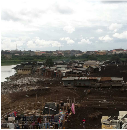
Fig 2 Typical view of informal settlement, Lagos, Nigeria