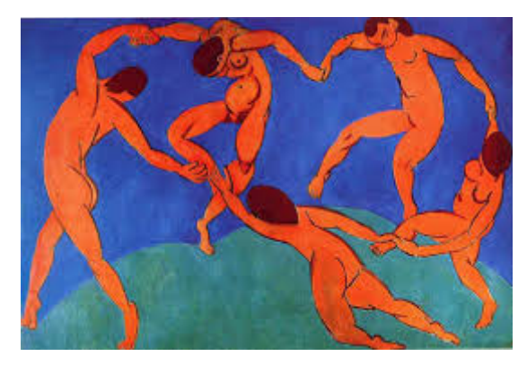
Figure 4 - Henri Matisse. La danse II.