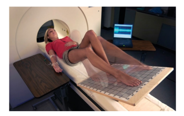
Figure 2 - A subject illustrating the tango dance task. Adapted from (Brown et al., 2006)

Although the studies of dance observation are very interesting, they are also limited, since the question about what happens in the brain while performing actual dance remains unaddressed. Despite technological and methodological challenges to get brain measurements while the body is moving, given the potential motion artifacts, the feasibility of conducting neuroimaging while dancing has been demonstrated, and several brain regions have been implicated in dance execution. Some researchers have created experimental paradigms that allow the study of some aspects of dance performance. For example, (Brown et al. , 2006) designed an apparatus allowing amateur tango dancers to perform tango steps (involving leg movements only) while in a positron emission tomography (PET) scanner, as illustrated in Figure 2. Results showed that the cerebellum was activated in the entrainment of dance steps to music, the putamen was involved in metric motion, and the superior parietal lobule was implicated in spatial guidance of leg movements (Karpati et al. , 2015). Unfortunately, this study may not be generalizable to more complex motor tasks or to real dancing.