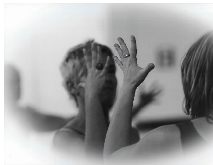
Figure 3 - The mirror effect.

As already exposed in part II, dance acts on many parts of the brain, including the cerebellum which is this crossroads that links movement to cognitive but also emotional processes (Vincent, 2018). Dancing in front of a patient also activates mirror neurons and the person can identify with himself, he can put himself in the other’s shoes. Dance Therapist creates a therapeutic link with the patient and sends him back through bodily movement a living image of himself. When the patient dances, there is a feeling of connection with oneself and at the same time with the other. Moving together in synchrony to the rhythm of the music makes it possible to embody the present moment and to be in total relational harmony. Our brain being programmed to imitate the gestures of the other, the patient understands that his gestures correspond to that of the dance-therapist, it is as if he perceived the other as a part of himself (Figure 3).