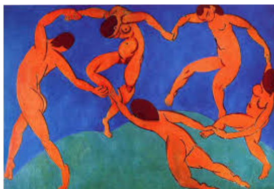
Figure 4 - Henri Matisse. La danse II .