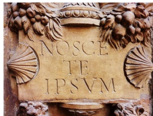
Figure 1 - Know Thyself - From the Apollo sanctuary in Delphi

The main point defended by somaesthetics is that enhanced skills of body consciousness can empower us toward better forms of self-knowledge and self-care (Mehling et al. , 2011). Interestingly, self-knowledge is an old issue in history, as illustrated by one of the most famous Greek maxims inscribed on Apollo’s ancient temple at Delphi: “Know thyself” (Figure 1). Moreover, ancient Asian traditions have long worked in self-knowledge subject by deploying body consciousness techniques, like meditation, embodied practices of Zen monastic everyday life, and yoga, which claim to deepen or “spiritualize” our senses and promote self-care. Indeed, recent studies in experimental psychology and neurophysiology have demonstrated that meditation training (including disciplines of self-examination, like body-scan) can effectively reduce symptoms of anxiety, depression, and panic (Saeed et al. , 2019). In modern philosophy, Friedrich Nietzsche 1 also honors the body as a great source of wisdom, by affirming the body as “an unknown sage” and urging people to “listen... to the voice of the healthy body”.