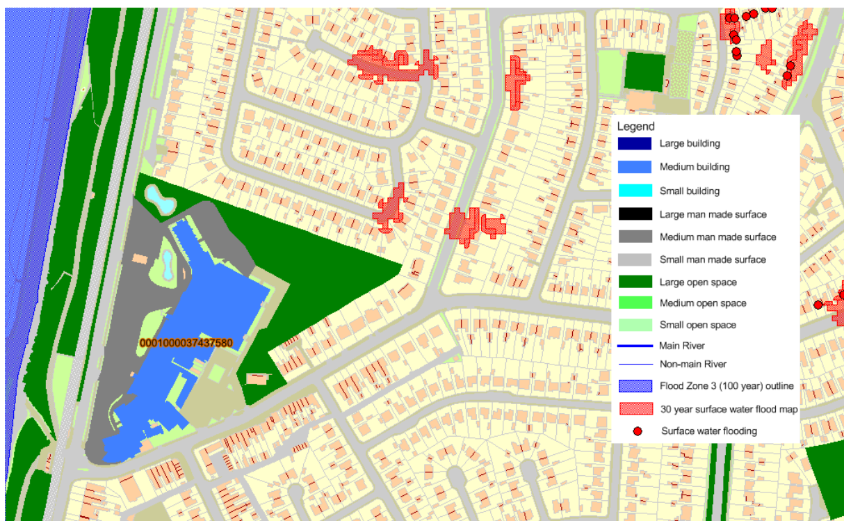
Figure 2: Additional information included for manual screening

To aid selection of the site for which a SUDS system was designed, some additional information was included (Figure 2). Surface water flooding maps (30 year return period) were displayed alongside the locations detailed in the flooding register of property flooding and the locations of non-main rivers, which may be suitable for receiving discharges from SUDS systems. This provided a good screening methodology to assess where SUDS retrofitting potential. It highlighted the areas that could contribute to the flood risk management and improve capacity in the existing drainage system. The screening has been also checked against Local Development Plans to assess the requirement for future developments and identify areas that would benefit from surface water removal to reduce pressure in existing drainage systems and provide capacity for future developments and economic growth.