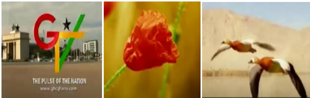
Figure 5: Visual symbolism from Ghana Broadcasting Corporation (GTV).

Despite the fact that the majority of Ghanaian citizens prefer communicating in local dialects rather than English, the national TV – the Ghana Broadcasting Corporation (GBC or GTV) – give the major daily news in ‘the language of colonization’ (English). Nonetheless, the TV set displays some local concepts and cultural symbols that portray the Ghanaian identity. Actually, before hosting the news, the jingle is composed of visual elements and a stimulating music soundtrack well-orchestrated in order to catch the attention of the viewers. Indeed, it begins with a very captivating message written in capital letters: “GTV: THE PULSE OF THE NATION” 5 ; followed by a powerful local sound playing in crescendo.