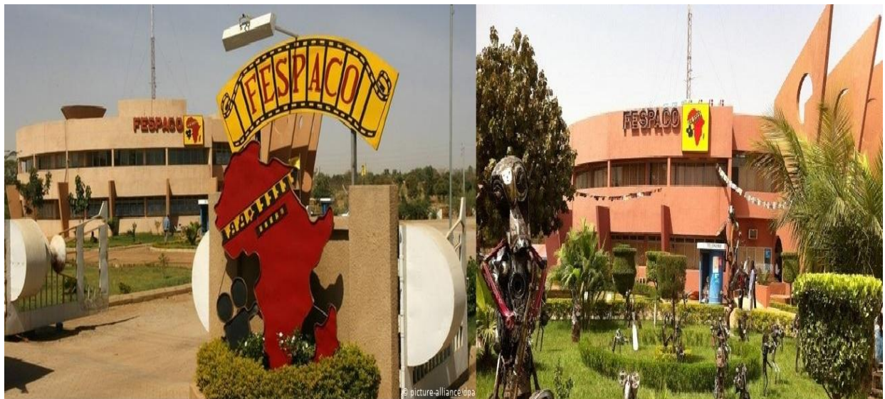
Figure 3: The headquarters of FESPACO in Ouagadougou, Burkina Faso.

Initially, FESPACO was created to portray the realities of African culture and identity through movies’ screens since 1972. Over the years, other goals have been added to the first. Today, FESPACO's mission is to promote and foster the dissemination of all works of African cinema inside and outside African continent. It is a favourable vitrine for exchanges between audio-visual professionals, artists and cultural experts. It also contributes to the socio-economic growth, the cultural development and the preservation of African identity.