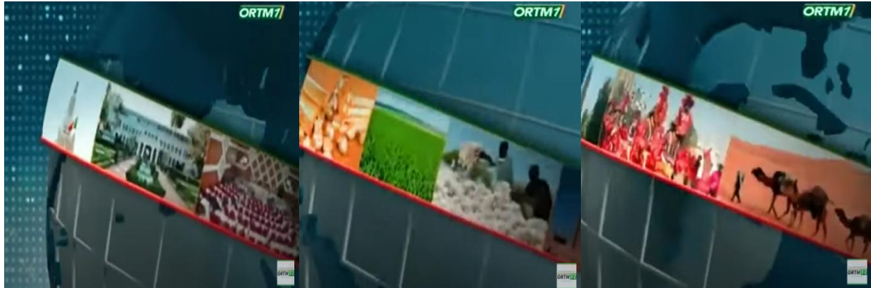
Figure 7: Visual symbolism from The Mali National Television (ORTM).

Finally, the Mali national television (ORTM) 7 also uses visual symbols to depict the country's local culture and identity. This state of fact is perceptible through the visual elements below (figure 5).