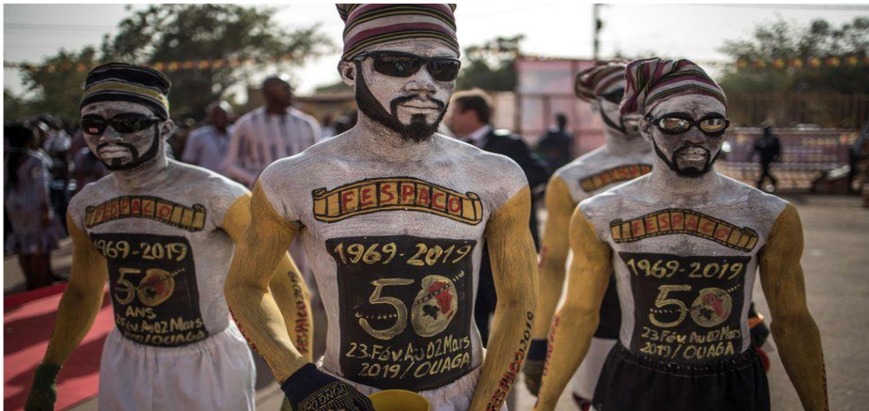
Figure 4: Body painting during the traditional parade of the 50 th anniversary of FESPACO.

Additionally, in 2019, during the 50 th anniversary of FESPACO, a traditional parade was organized by the promoters to magnify African cultural identity with aboriginal choreography and body painting that reflect local symbols. See the picture (figure 4) below.