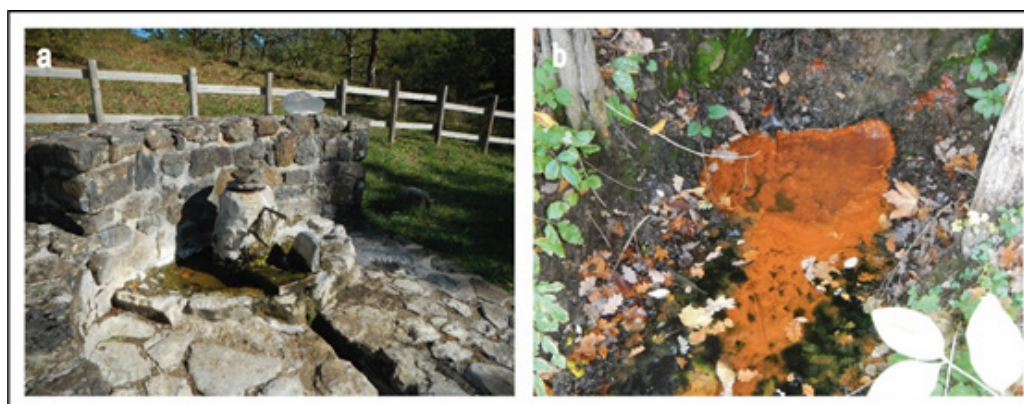
Figure 1: Man-made spring a. (named “Salins”) vs natural spring b. (named “Salut”).

The project DISCOVER started in 2019 focused on the study of diatoms communities inhabiting 22 mineral springs of the FMC: 1) 12 TMS emerged in a naturally context; 2) for 10 others, springs are characterised as Man-made springs or springs with medium-to-high anthropogenic activities (Figure 1, Annex 1). The mean of diatom species number in natural springs was 15 \pm 3 in autumn 2019 and 16 \pm 7 in spring 2020. Man-made springs showed generally lower richness with a mean of 7 \pm 5 for autumn 2019 and spring 2020. A Kruskal-Wallis tests reveals significant difference between species richness of natural and Man-made springs (p=0.003 in 2019 and p=0.001 in 2020) (Figure 2) and no difference when considering the Shannon index.