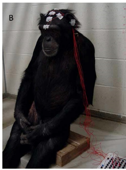
Figure 2: (A) Developmental neuroscience. Fetal brain development in chimpanzees was measured by a non-invasive ultrasound technique. (B) EEG recordings in a chimpanzee. The