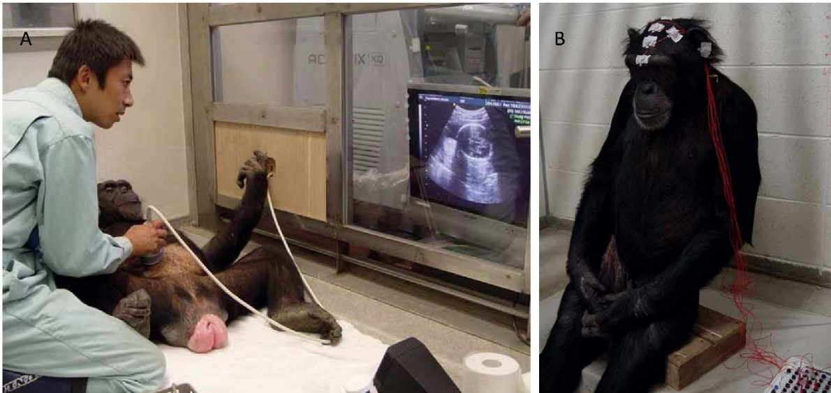
387 388 Figure 2: (A) Developmental neuroscience. Fetal brain development in chimpanzees was 389 measured by a non-invasive ultrasound technique. (B) EEG recordings in a chimpanzee. The 390 chimpanzee quietly sat on the chair and allowed the experimenter to put electrode patches 391 on the skin of her forehead and the top of her head.