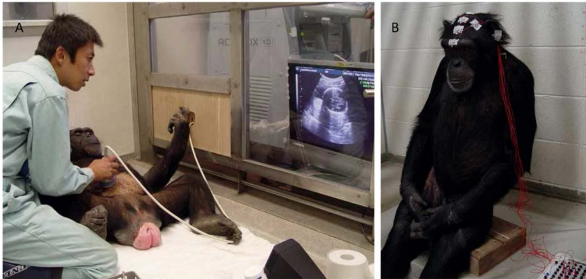
218 219 Figure 2: (A) Developmental neuroscience. Fetal brain development in chimpanzees was 220 measured by a non-invasive ultrasound technique. (B) EEG recordings in a chimpanzee. The 221 chimpanzee quietly sat on the chair and allowed the experimenter to put electrode patches 222 on the skin of her forehead and the top of her head. Photos provided with the courtesy of 223 Satoshi Hirata.

224 225 Some traditional approaches involve bringing animals into a lab and restraining them while 226 they perform tasks in order to ensure stable gaze-tracking and neural recordings. However, 227 this unnatural setting does not permit the study of brain activity during natural, social and 228 complex behaviours. Specific ethical guidelines exist now for research in the wild 113,114 . The 229 likely benefits and possible negative effects of researchers' presence and field methods on 230 study subjects, their environment and the local human community should, of course, be 231 considered 115 . New technologies allow us to bring science into the wild and test animals in a 232 free condition in their natural environment, thus removing any experimental source of stress 233 (as they would come by themselves to be tested) and measuring their entire behavioural 234 repertoire. This allows to study behavioural responses and the brain activity during natural, 235 social and complex behaviours. This field works are possible in many species including 236 rodents 116–118 . The animals studied can be identified using RFID techniques 119 but also via 237 artificial intelligence with the recognition of individuals by videotracking 120–122 . The latter 238 removes the need to catch animals. A location can then be defined where different 239 touchscreens deliver food, with activation only for certain species and individuals.